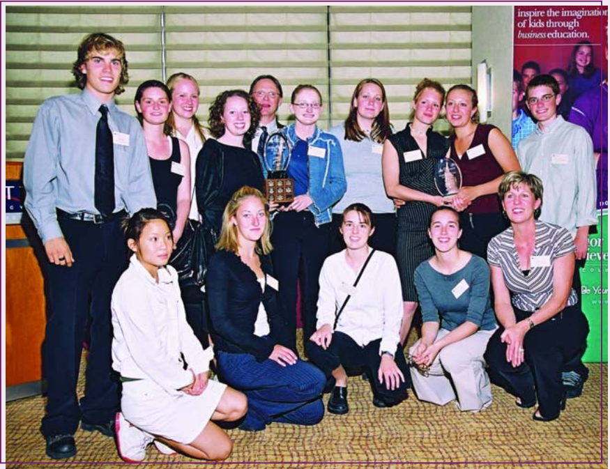
Mount Doug Event Marketing Co., Mount Doug Senior Secondary, Winner of the 2003 JACAN Company of the Year Award.