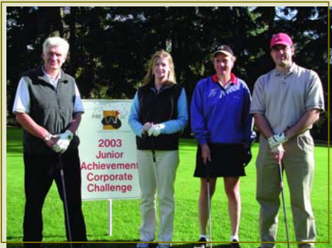
The foursome from Guardian Capital Advisors Inc. came out to enjoy a day of golf and to raise money for JABC.